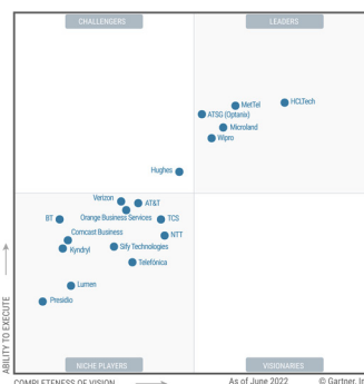
Figure 1: Magic Quadrant for Managed Network Services

This recognition further validates Comcast Business as a leading global provider of managed network solutions with strengths serving highly distributed enterprises across a variety of vertical markets.